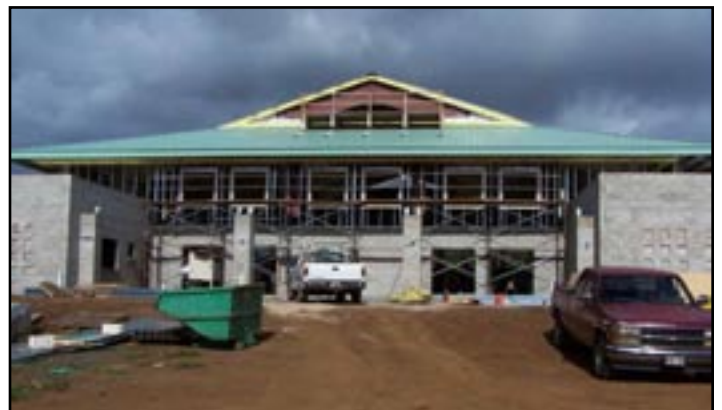
The Samuel W. and Edith K. Wilcox Gymnasium as of mid January, '07.

Mark your calendars for Saturday, March 10, 2007, and plan to attend the annual auction, 'Under the Sea', at the Kaua'i Marriott Ballroom celebrating Island School's Pearl (30 year) Anniversary.