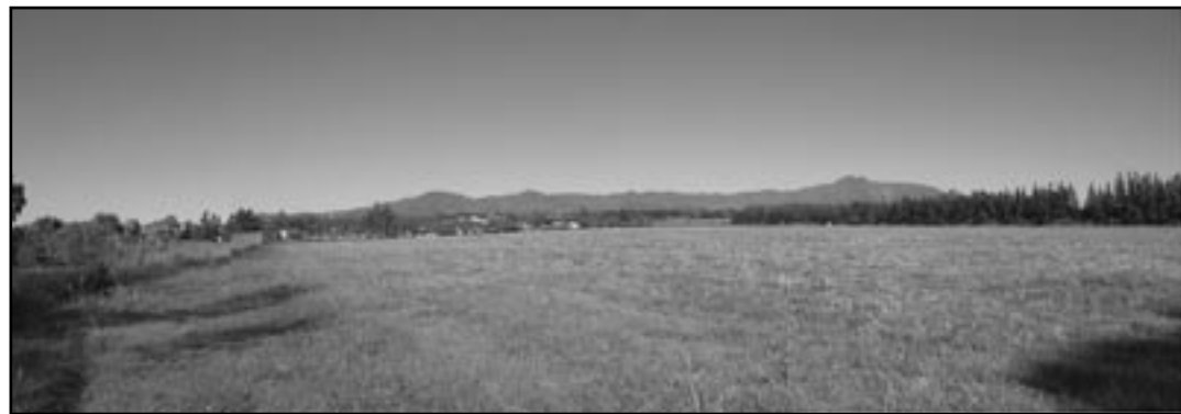
Future site of gymnasium, halau, looking at the existing campus to the northwest.

Looking to the future, Island School hopes to soon add KIF teams in volleyball, soccer, basketball, bowling and golf. Some of these new sports teams hopefully will be able to take advantage of the school's new gym, which is currently on the drawing boards.