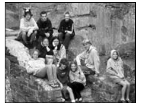
The group visits the ruins of a 17th century fort in Kinsale, Ireland.